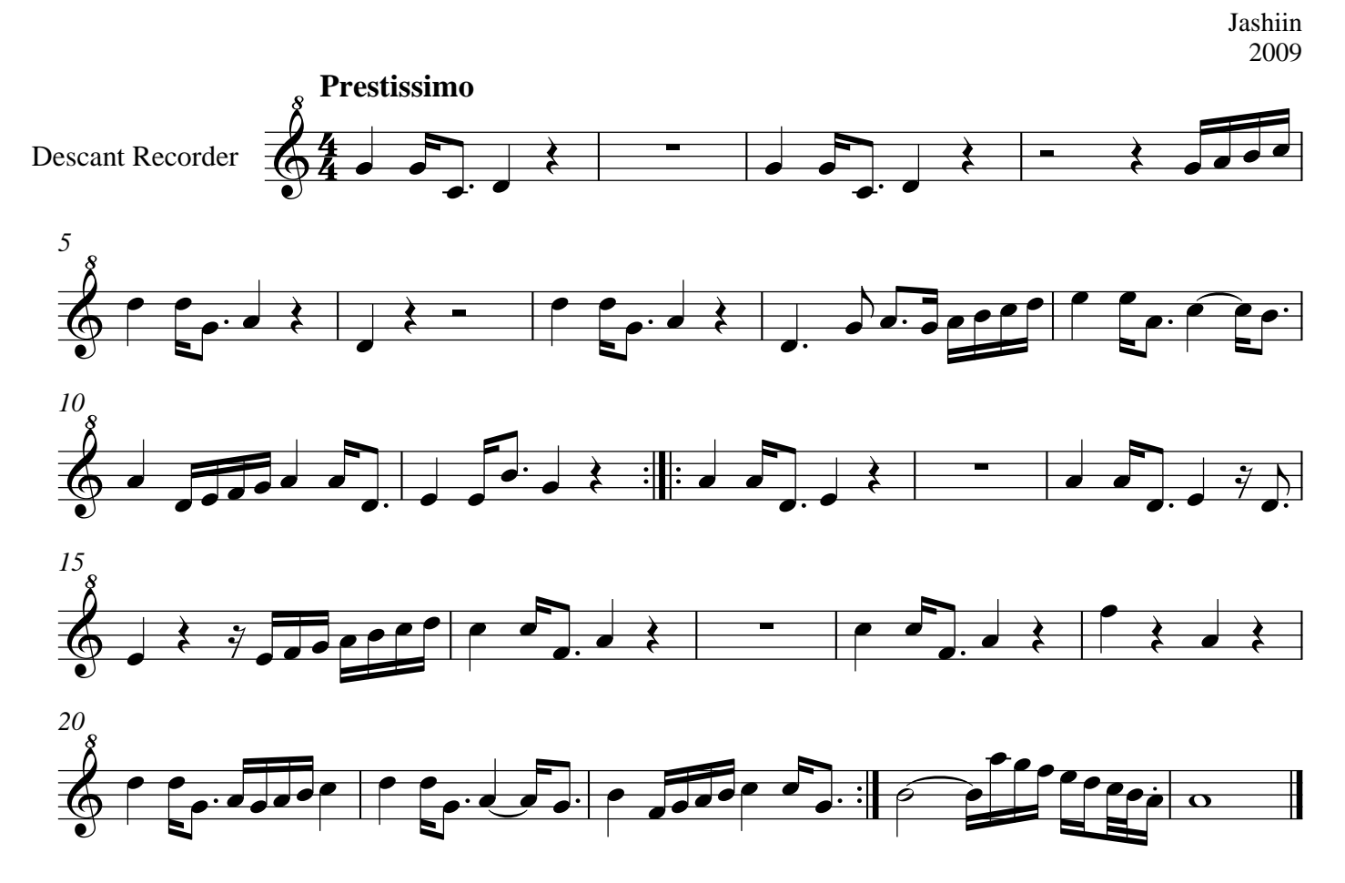
Fuga (Pieces for Recorder, no. 5b)