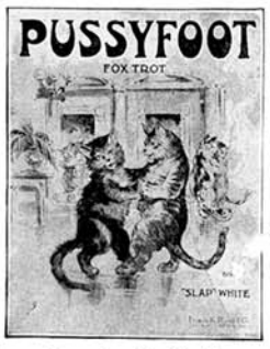
Popular Fox Trot Hit

Complete Copies on Sale Wherever Music is Sold!