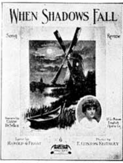
The Concert Ballad Success