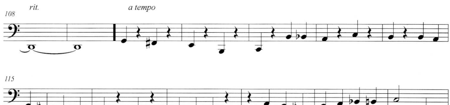
Overture to Rienzi