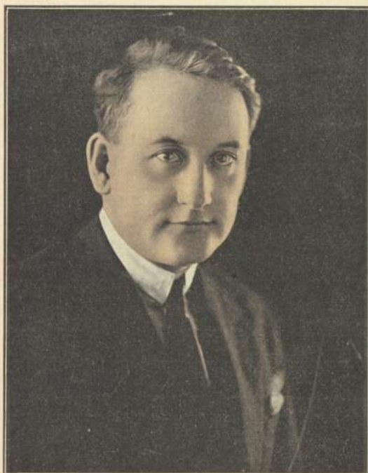
Underwood & Underwood Studios, New York