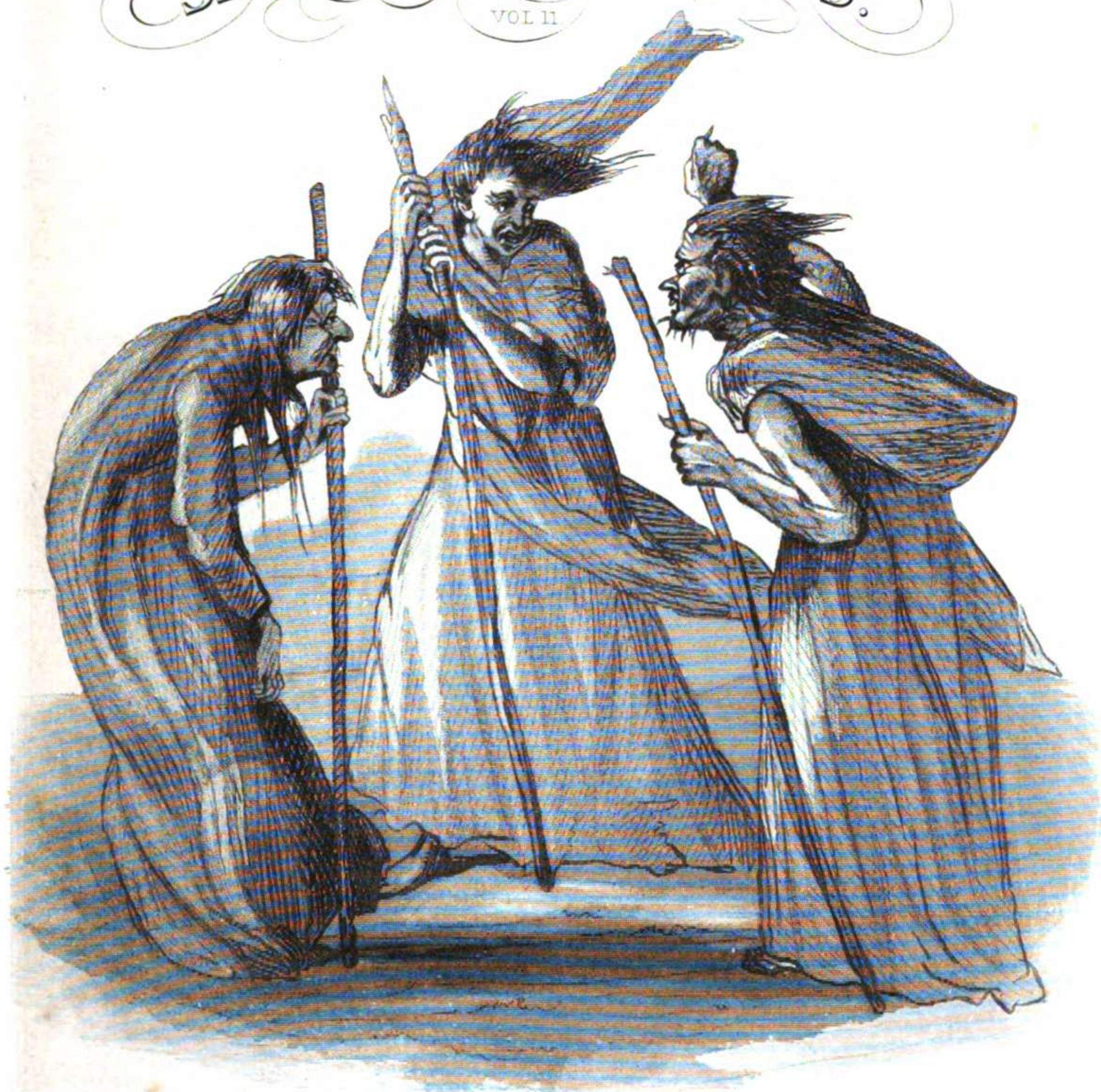
"A Sailor's wife had chesnuts in her lap"