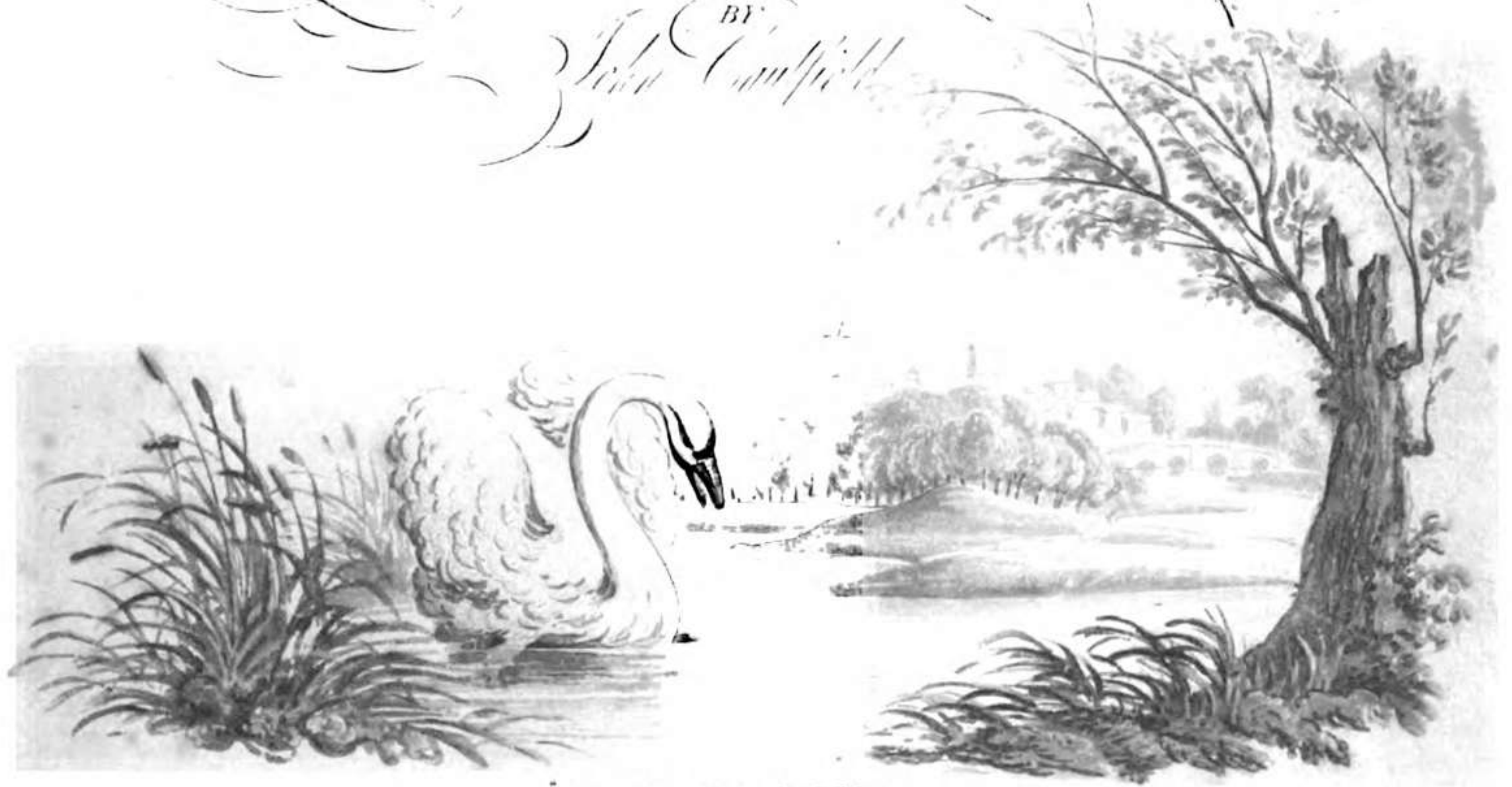
THOU SOFT FLOWING AVON" &c.

Published & Sold by J. Caulfield, 7, Fountain Court, Strand.