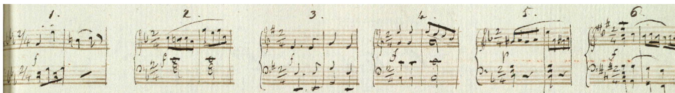
Verzeichniss über Zwei Hundert meiner Compositionen