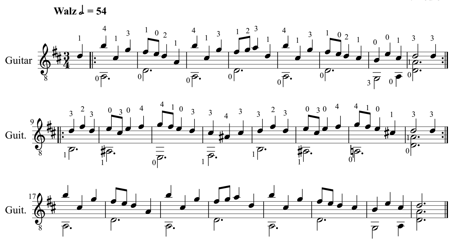
Study For Guitar No. 2